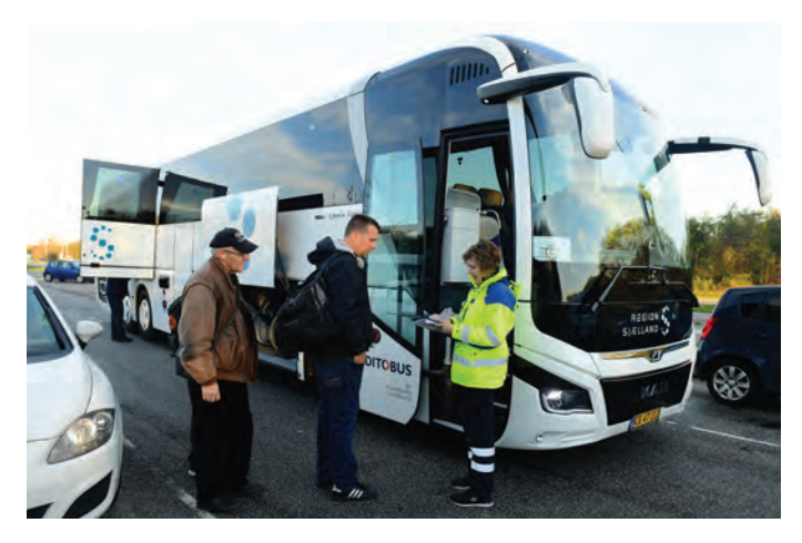
TOP FlexTrafik's technology masterminds converse with staff in the command center. The status of trips is tracked on wall monitors. 115 FlexDanmark employees ensure the buses run smoothly, payors are properly billed, and services are coordinated with larger regional transportation operations.